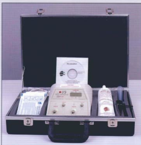
J5 Myo-monitor – Complete with case, all accessories and Myo-monitor Clinical Technique CD.